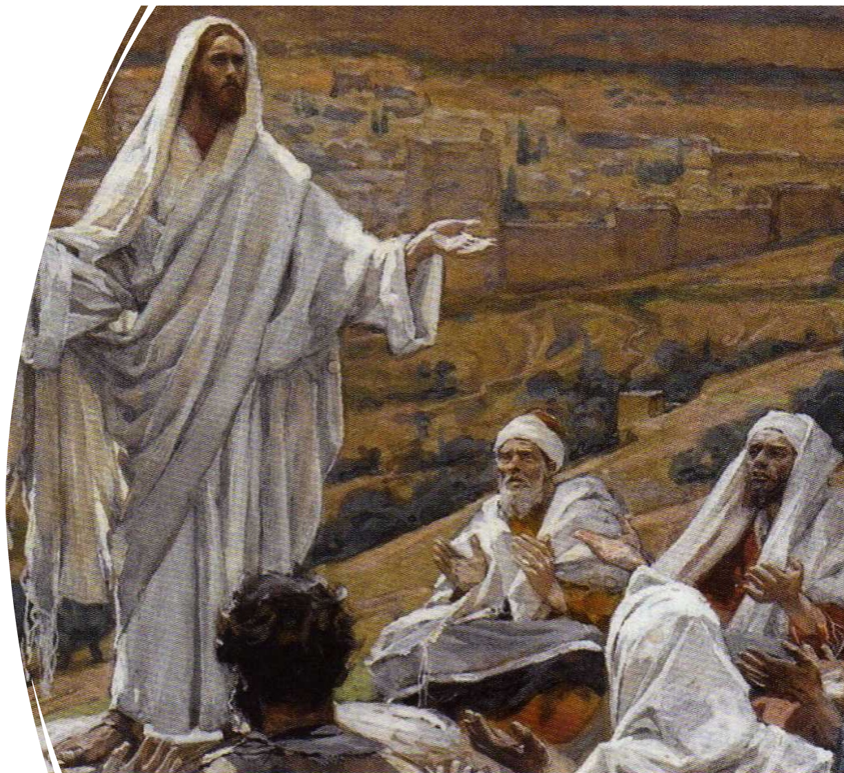
Lord's Prayer by French painter James Tissot (1836-1902)

Father, hallowed be your name, your kingdom come. Give us each day our daily bread. Forgive us our sins, for we also forgive everyone who sins against us. And lead us not into temptation.”